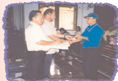
Homeless receive scripture & cash gifts.