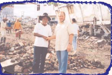
Helping rebuild with FAITH, HOPE & LOVE!