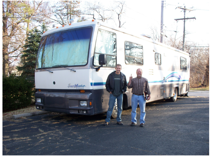
Creative Donations: This RV was donated to H.I.M.