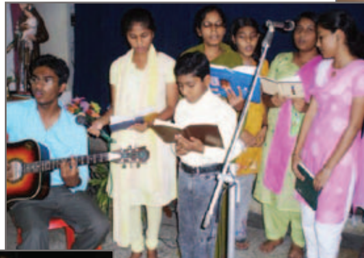
◀ Musical Equipment