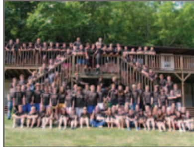
▲ Youth Camp, USA