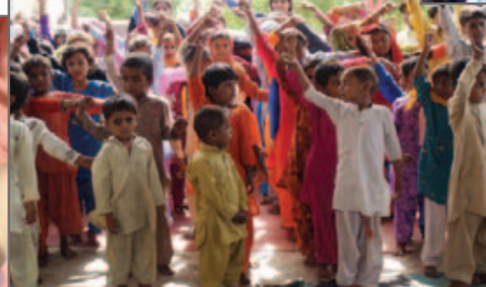
▲ The Growing Church