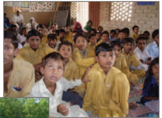
▲ Schools, Pakistan