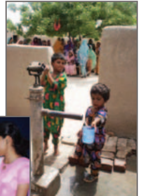
▲ Feeding Programs, Zambia and Philippines