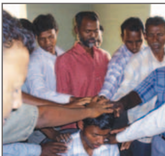
▲ Church Planters, India