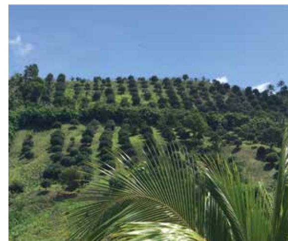
The mango trees you see here were planted years ago as an investment opportunity. HIM partnered with several Filipino pastors to plant the trees with the intent that the mango fruit could be sold and provide an income for them.

As you can see, we absolutely value the need to meet people's basic needs. However, that is not our primary goal. SPREADING THE GOOD NEWS is our focus above everything else.