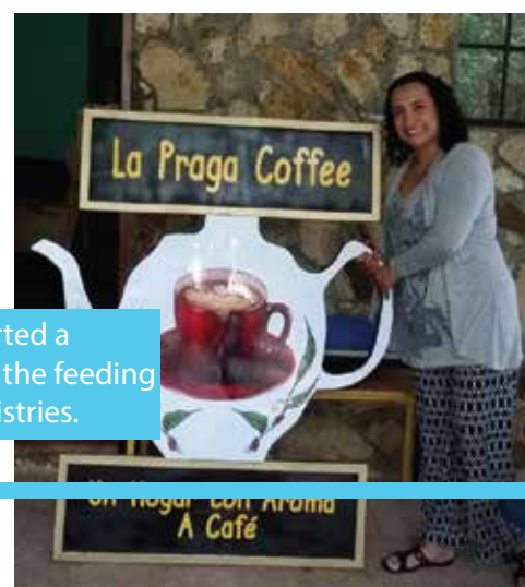
Celtina (Nicaragua) started a coffee shop to support the feeding program and local ministries.