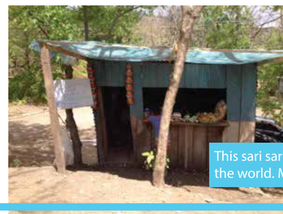
This sari sari store is a common convenient store found in rural and impoverished areas of the world. Many times they are family run and are set up in the front of the family's home.