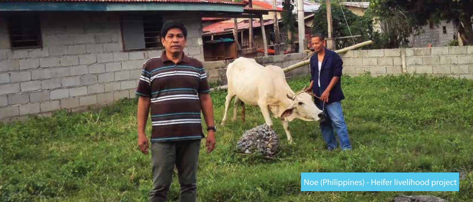
Noe (Philippines) - Heifer livelihood project