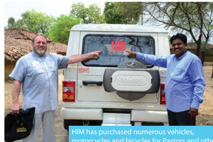
HIM has purchased numerous vehicles, motorcycles and bicycles for Pastors and others all over the world. Here is one example of a vehicle this Pastor uses to travel to rural areas.